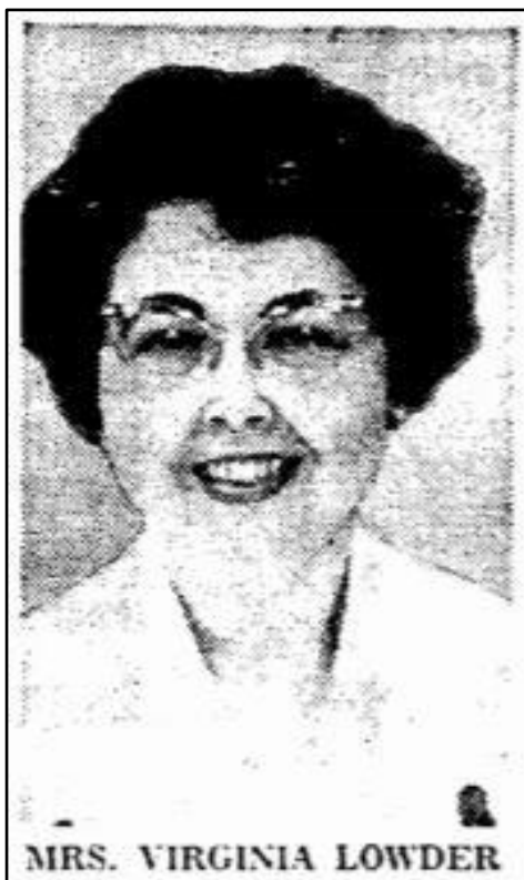
Washington Evening Star (Washington, DC) 24 December 1964

The News (Frederick, MD) October 7, 1960