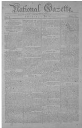
A National Gazette with Kentucky's state constitution National Gazette. (Philadelphia, PA), 28 June 1792.

three months before the initial deadline of September 5, 1791. 191 192 193 The speed at which the McDowell and his deputies completed the enumeration is noteworthy because four months prior, Congress authorized Kentucky's local government to create the administrative framework that was essential to it becoming a new state and the count would determine the number of Representatives the new state would have in Congress. 194 Kentucky became a state on June 1, 1792 with an official population of 73, 677 people and was allocated two representatives. 195 196