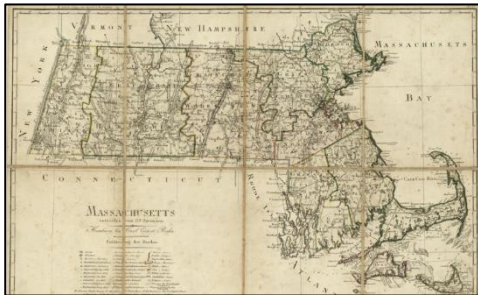
1796 map of Massachusetts

After the war, Jackson continued to participate in local and state politics, but he also sought to recoup his financial losses. Initially, Jackson attempted to resurrect his importation business, but he was unable to replicate his earlier success. Next, Jackson obtained a commission as officer in the federal forces that were tasked with ending Shay's Rebellion (August 1786–January 25, 1787). While both of these ventures proved to be unfruitful for Jackson's financial situation, they did help him become the first U.S. marshal for the District of Massachusetts. 47 Shortly after his inauguration in April 1789, President Washington received a host of applications and visits from people who were interested in securing a position for themselves within the new government. At first Jackson planned to lobby the President for the lucrative