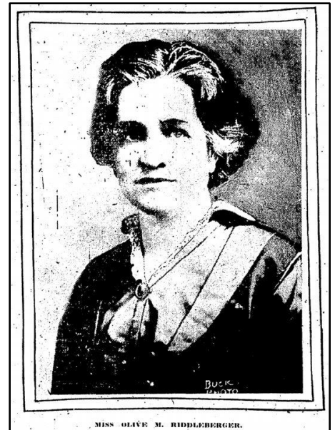
Washington Evening Star (Washington, D.C.); 2 Jan 1916

The U.S. Census Bureau has always been ahead of the curve when it comes to employing women. Ever since 1880, when it started using professional enumerators rather than U.S. marshals, the Census Office had employed women in that role. With the advent of the Hollerith tabulating machine in 1890, women moved into the role of keypunchers. By 1909, 10 years before the 19 th Amendment granted national women's suffrage, over 50 percent of the Census Bureau's 624 employees were women. As women proved themselves as capable as the men, and with the increasing number of women in the workforce, it became harder for the Census Bureau to justify assigning all supervisory positions to men. By 1920, the Census Bureau would once again push forward by appointing the first five female supervisors, as well as the first three female expert chiefs of divisions.