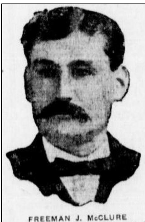
The Oklahoma State Capital (Guthrie, OK) 15 Dec 1906

On September 17, 1907—120 years to the day after founding fathers signed the U.S. Constitution in 1787—the people of Oklahoma voted and approved their state constitution by 71 percent. On November 16, 1907, having completed all requirements for statehood, including a current census, Oklahoma became the 46 th state.