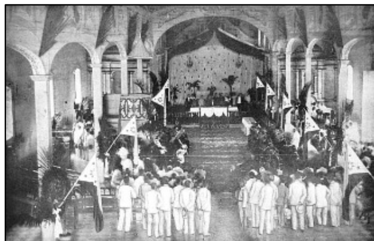
Inaugural Session of the Malolos Congress, 1898.