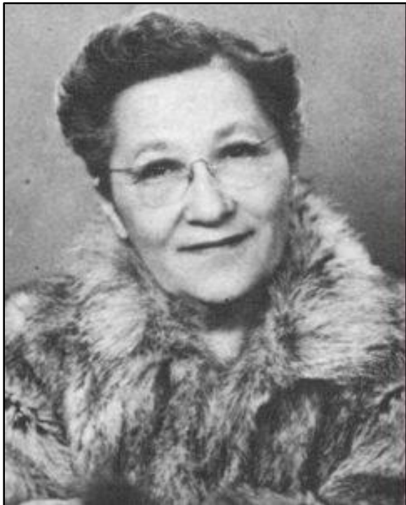
Alaska Women's Hall of Fame (accessed 1 Sep 2017)

Aleut Teacher, Community Leader, Census Enumerator