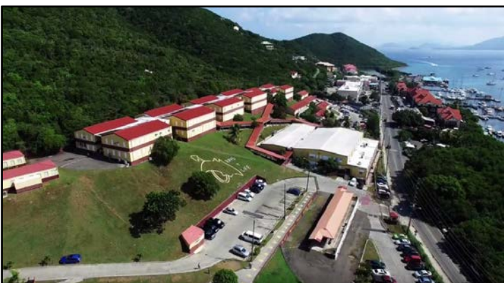
Ivanna Eudora Kean High School in 2016 IEKHS Breast Cancer PSA, Theater Tech I Class, IEKHS (St. Thomas, USVI), 2016. Accessed through YouTube (April 1, 2019).