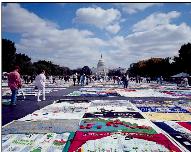
The AIDS Quilt displayed in Washington, D.C.

The Santa Cruz Sentinel (Santa Cruz, CA), 12 October 1987