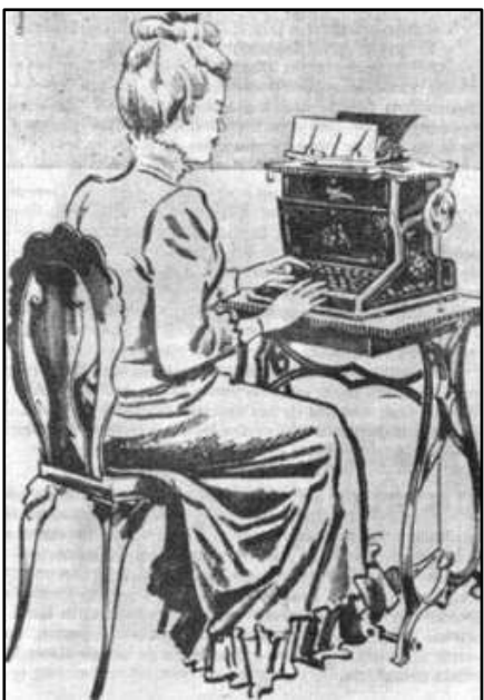
Newspaper depiction, c. 1901