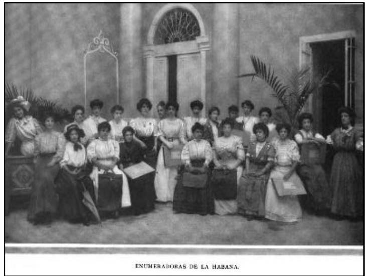
Photograph of female enumerators from Havana, 1907

American troops departed in 1902, after the ratification of the new Cuban constitution. However, when the new Cuban government faltered in 1906, American troops returned that fall to restore order to the island. Once again, the military government authorized a census, which took place in 1907. As before, the Census Bureau tabulated the results in Washington, DC, but Cubans did most of the work on the ground. Once again, Emilia served as an enumerator, covering several districts in Havana.