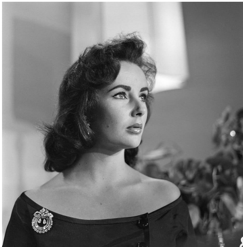
Elizabeth Taylor in 1957.

woman who is an honest performer. Therein lies her identity.”