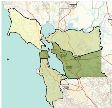
PROFESSIONAL, SCIENTIFIC & TECHNICAL SERVICES BUSINESSES IN SAN FRANCISCO METRO COUNTIES: 2007

While the Professional, Scientific, and Technical Services sector was the largest employer in the San Francisco metro area, the Wholesale Trade sector reported the highest 2007 sales ($111.8 Billion). The San Francisco metro was ranked 7 th among U.S. metros in the number of businesses in the Professional, Scientific, and Technical Services sector (18,935 establishments).