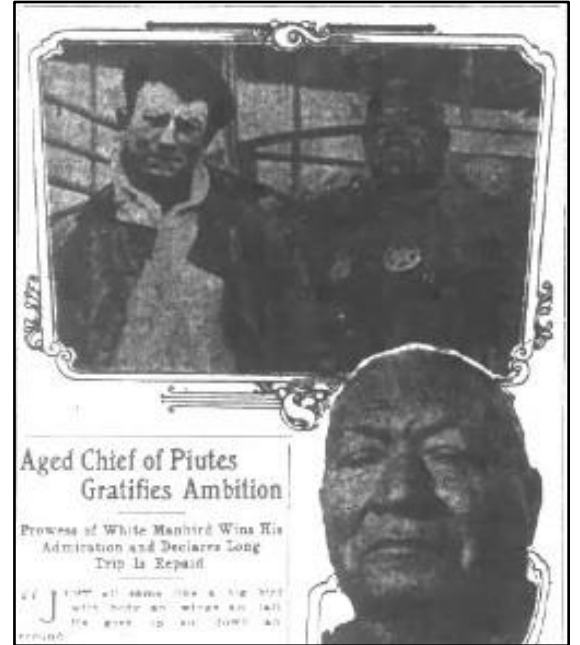
The San Francisco Chronicle (San Francisco, CA) 23 July 1913