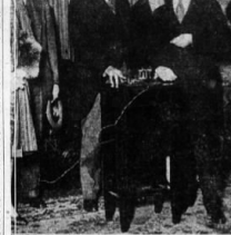
President Curtis of the United States, surrounded by prominent people of Rhode Island, opens the toll bridge in Rhode Island.