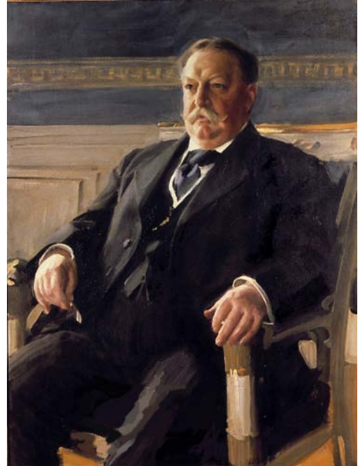
William Howard Taft was President of the United States on Census Day, April 15, 1910.

Difficulties with the tabulation process continued despite the presence of automatic counting machinery introduced in the most recent censuses. Correcting these problems delayed publication of some population numbers. Some census results, such as the total population of cities, were issued first as brief press