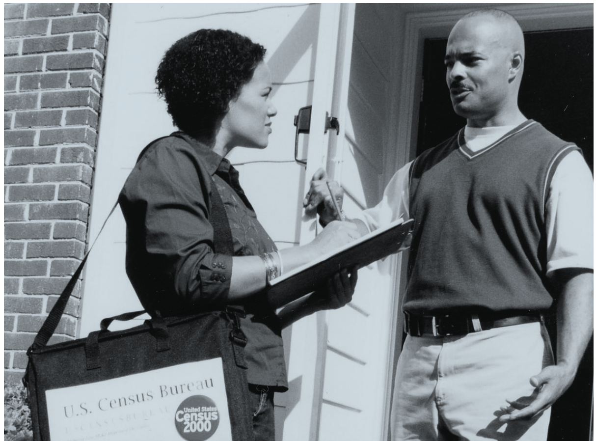
A Census Bureau field representative visits the household.

This cross-sectioning of the housing inventory gives a picture of houses and households as they change over long periods of time.