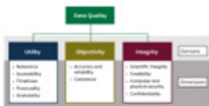
Figure 03-1. The FCSM Data Quality Framework