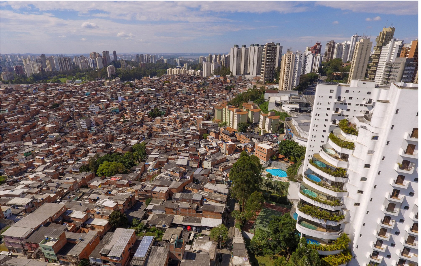
This photo from the Paraisópolis favela in São Paulo, Brazil, captures the stark contrast between formally and informally settled urban areas.