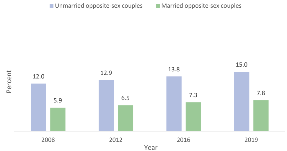
Figure 2b. Percent of Opposite-Sex Couple Households That Are Interracial for Selected Years

* Prior to 2013, those reported as same-sex spouses were shown as unmarried partners in the data.