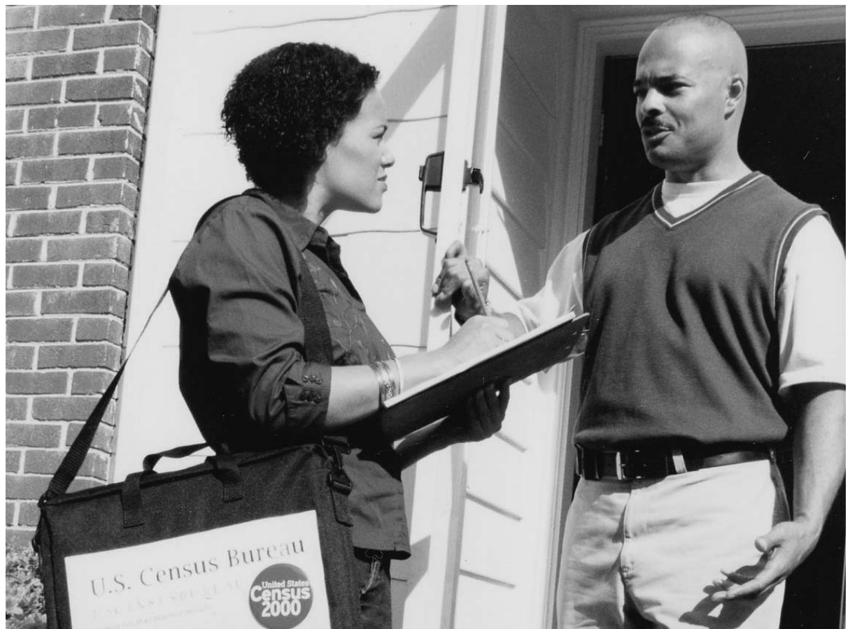
A Census Bureau field representative visits the household.

This cross-sectioning of the housing inventory gives a picture of houses and households as they change over long periods of time.