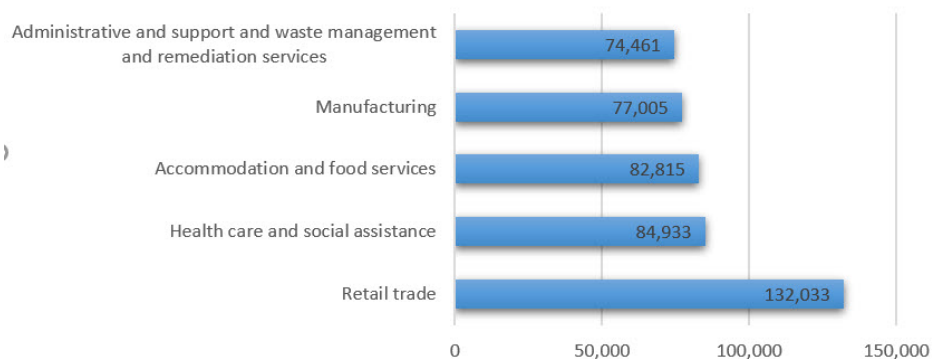
Number of Employees in 5 Selected Sectors: 2017