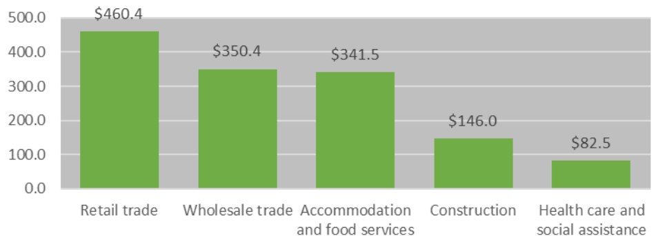
Sales, Value of Shipments, or Revenue in Selected Sectors: 2017 ($ Million)

(Note: Excludes the Utilities Sector and the Arts, Entertainment, and Recreation Sector where revenue data was not available.)