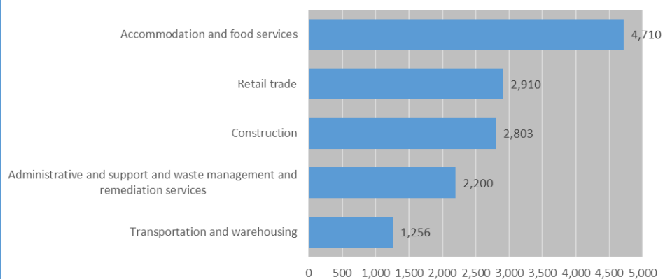
Number of Employees in 5 Selected Sectors: 2017